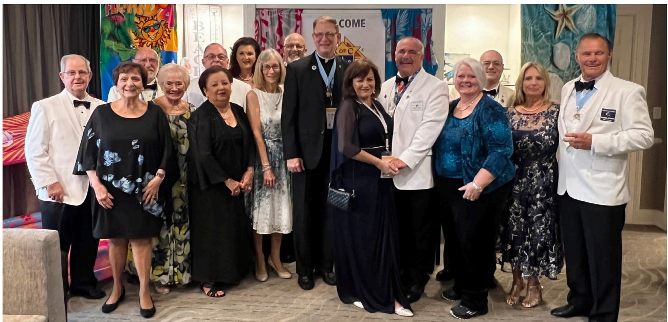
Florida State Delegation to the Supreme Convention

By the way the Florida State Council is hosting the 2023 Supreme Convention in Orlando. Keep in mind you do not have to be a delegate to attend the Supreme Convention. Just come, have fun and see the other side of the coin. We can share a good time and make a lot of memories.